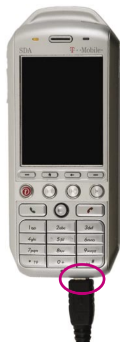
USB Cable AC Adapter

Note: If battery power is completely drained, then you have to use the AC adapter to charge it instead of using the USB cable.