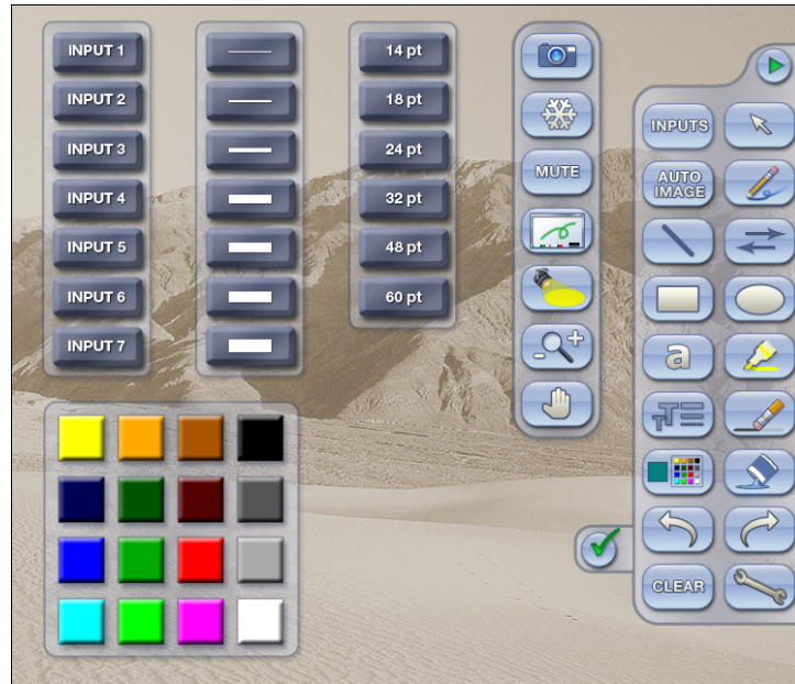
Figure 4-4 — Annotation menu examples

Inputs selection, Pointer, Auto Image, Freehand, Line, Arrow, Rectangle, Ellipse, Text, Highlighter, Size select, Eraser, Color, Fill, Undo, Redo, Clear, Tools - Capture, Freeze, Mute, Whiteboard, Spotlight, Zoom, and Pan.