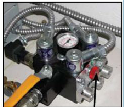
Emergency down valve

The elevator can be lowered manually by turning the red emergency down valve counter-clockwise and holding it until the car reaches the desired level. This red valve can be found on the side of the hydraulic control valve.