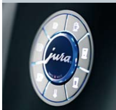
Follow your intuition