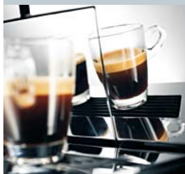
A reflection of excellence