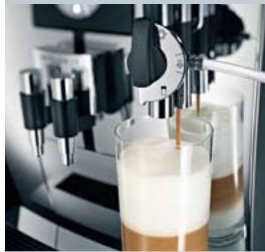
Latte macchiato at the touch of a button