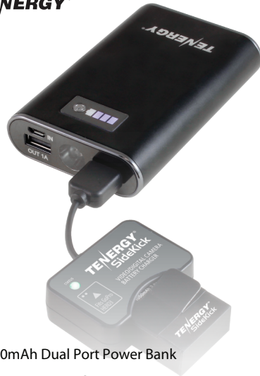
5200mAh Dual Port Power Bank