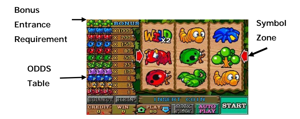
Main Screen of Bug symbols