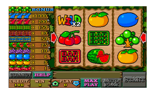
Main Screen of Fruit symbols