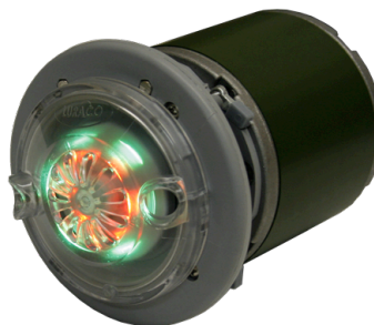
Dura-JET III with LED Light