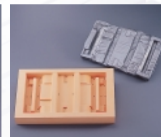
A poured plastic part produced from a mold milled in chemical wood