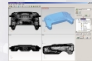
MODELA Player 4

MODELA Player 4 is a CAM software application that accepts IGES, DXF* and STL files exported from most popular industrial 3D CAD software programs. It is used to generate proportional 3D scaling, identify milling direction and to automatically generate and display the tool path. MODELA Player 4 supports tool changing when used with the Automatic Tool Changer (ATC) and automatic side cutting when used with the Rotary Axis Unit. It can also be used for 3D engraving. *3D DXF compatible with AutoCAD® R12