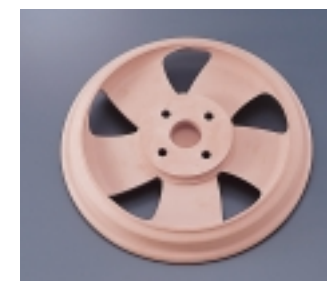
A wheel cover prototype

The MDX-650 also supports industry standard NC codes. NC codes provide connectivity with a wide variety of commercial 3D and CAD/CAM software.