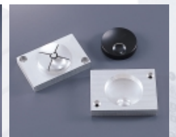
Male and female molds milled from aluminum