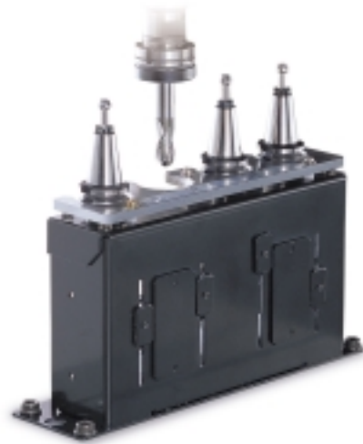
The MDX-650 with ATC automatically changes tools by specifying the tool's stock number from the included CAM software.