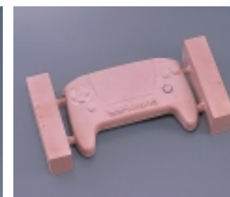
Small part prototype