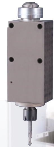
High Precision Spindle ZS-650TY

For extremely detailed projects, choose the MDX-650's High Precision Spindle. An excellent choice for milling metals, deep milling and high-speed milling, the High Precision Spindle's reduced tool vibration produces a smoother, more detailed mold. For added versatility, commercially available ISO15488 collets can also be used.