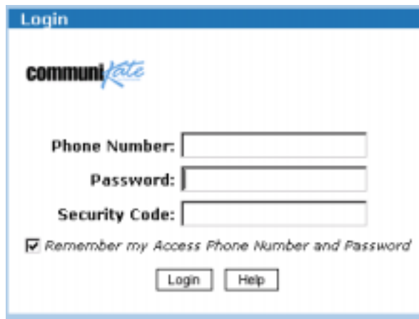
CommuniKate Login Window