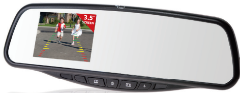
with Mirror Monitor