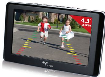
with Dash Monitor