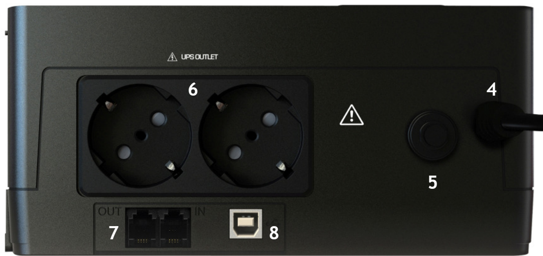
Figure 2 - Rear Side

On ECO STRIP rear side there are (see figure 2):