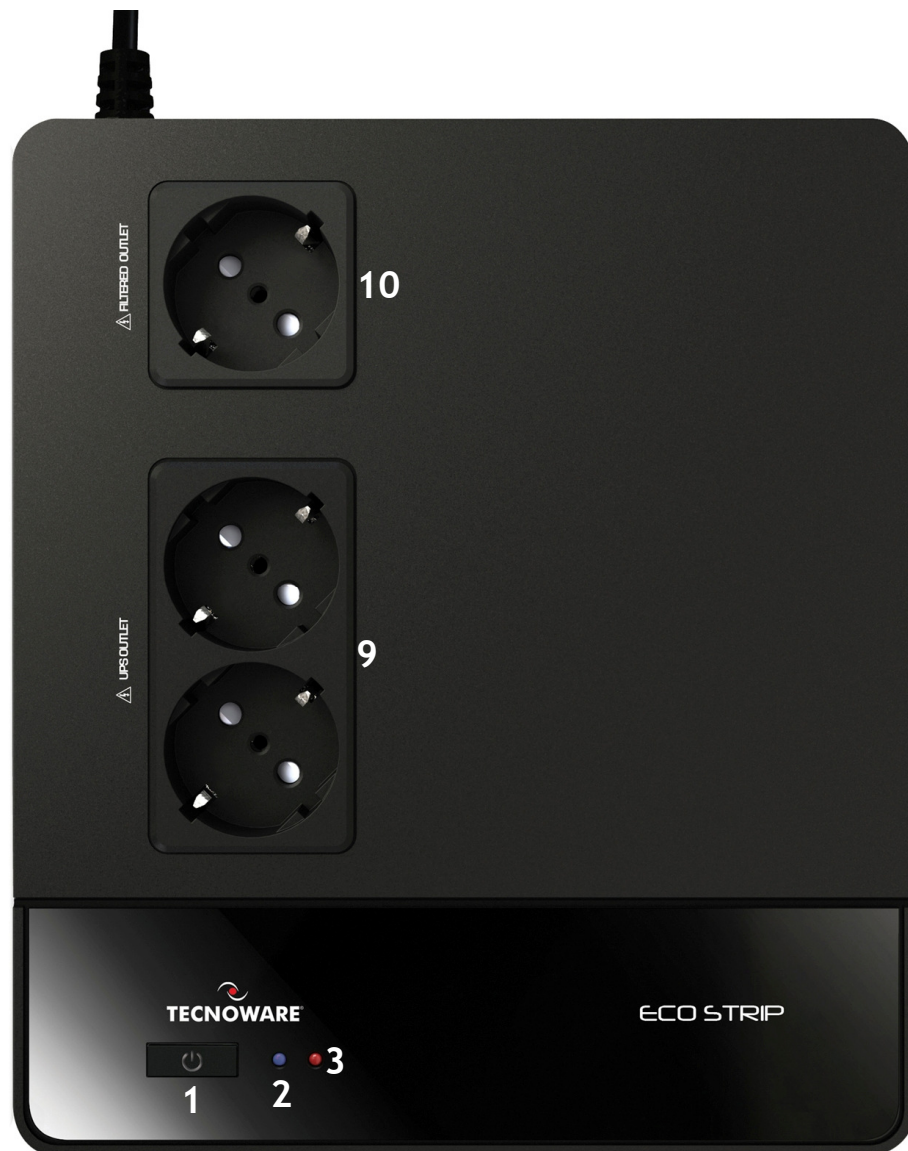
Figure 1 - Front panel