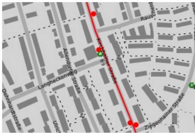
Some bus stops in Frankfurt