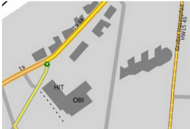
Bus routes in Frankfurt

-routelabelcolor=TEXT (color for labels of routes) -routelabelsize=INTEGER (DEFAULT=8) -routelabelfont=TEXT (DEFAULT=sans-serif) -routelabeloffset=INTEGER (DEFAULT=10)