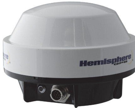
Figure 1-1: A325 smart antenna

Note: Throughout the rest of this manual, the A325 Smart Antenna is referred to simply as the A325.