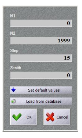
Fig. 3 "Parameters" dialog box

If actual data grid of a lidar signal stored in the database differs from the required one (i. e., that one which is defined by the "Parameters" dialog box), then data stored in the database will be projected onto the new grid, and linear interpolation will be used to obtain signal values at heights missing in the original grid.