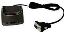
RS-232/USB Docking Cradle