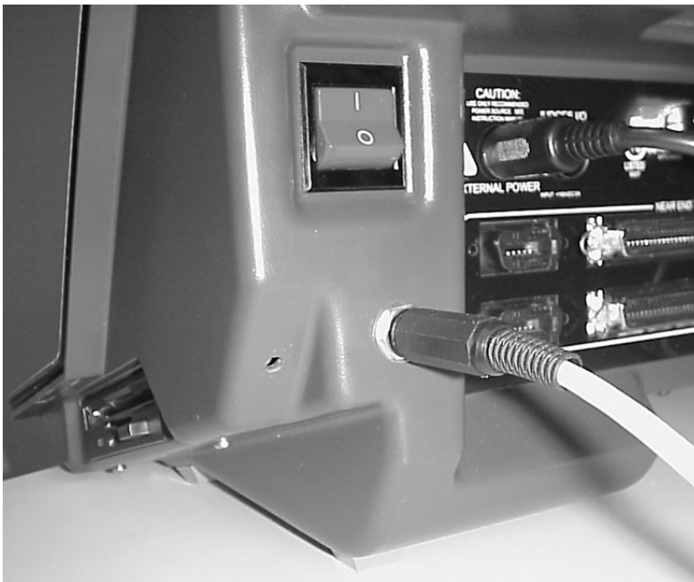
The scoreboard and power jacks on the back of the System 6

Connect the DIN connector from the 15-volt power supply that came with your System 6 to the external power connector on the back of the System 6, and plug the adapter into a working AC outlet. Use only the recommended power supply! Use of any other power supply (including a System 5 power supply) may cause serious damage to your system.