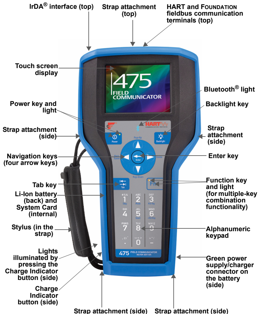
Figure 1. 475 Field Communicator with the Protective Rubber Boot