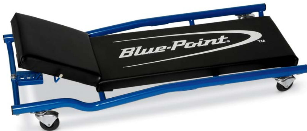
JCW10 – Adjustable Oval Tube Creeper