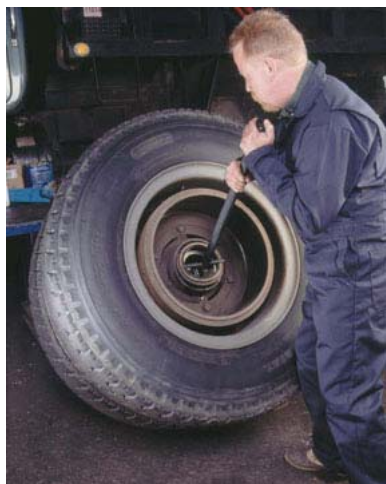
The drive wheel shown is from a 54,000 pound dump truck.