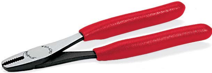
5ACP - Midget Pliers (4 3/4")