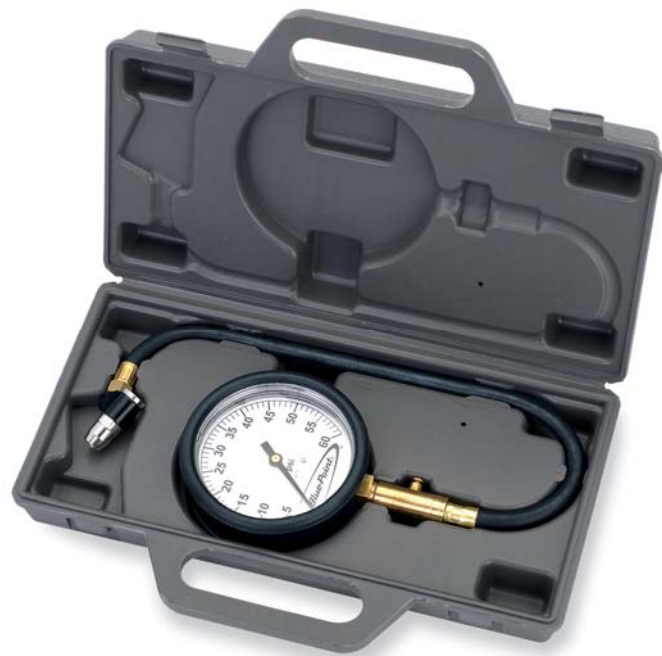
TPRG60 – Pro Race Gauge – 60 PSI