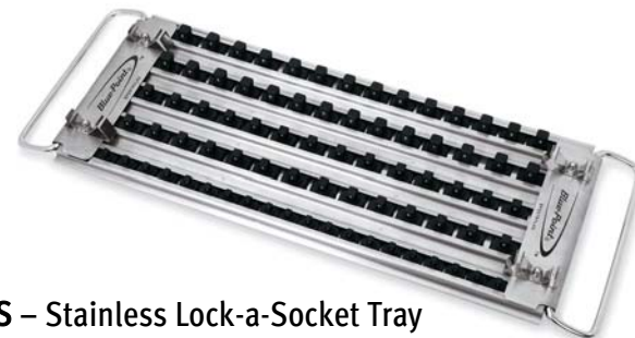
BPSSTRYLAS – Stainless Lock-a-Socket Tray