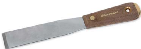
PKWLR53A – 1 1/4" Long Reach Chisel Edge Scraper Knife w/Steel Head