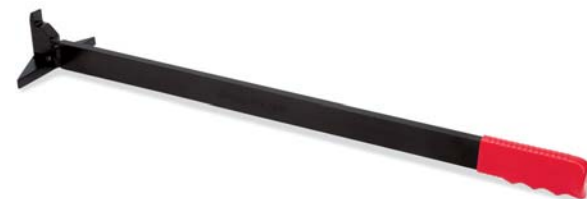
SRT1 – Heavy Duty Truck Seal Removal Tool

• Read additional safety precautions on pages 534 to 537 in product catalog CAT1000