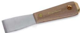
PKWSS53A – 1 1/4" Heavy Duty Short Knife w/Chisel Scraper EU-GB