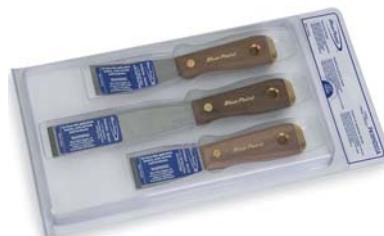
PKWHD53A – 3 Piece Walnut Handle Scraper Set includes: