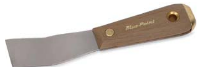
PKWBS53A – 1 1/4" Heavy Duty 30° Bent Knife w/Chisel Edge Scraper