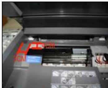
Stick the Support arm at 3cm distance from the left side, and at 4 cm distance from the upside of the printer