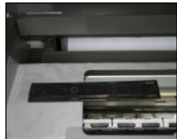
as the position show on the above picture.