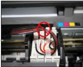
The tube is twist ,it is not ok.