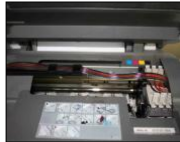
In this situation ,it is ok

8、 Step Eight: Install the clamp like the Picture Shown(Pic A), Plug the power connector (Pic.A) ; Turn on the power (Pic B). Watch for anything unusual.