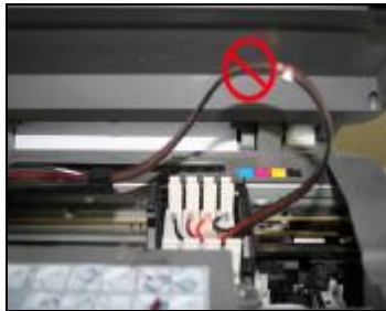
The tube is excessive long, it is not ok.

Adjust the tube length and move the cartridge car. Insure there will no block and collision when the tubes moving with cartridge car .Insure there's plenty length of tube to make the cartridge cart can thoroughly move to the left side.