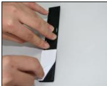
Rip the label