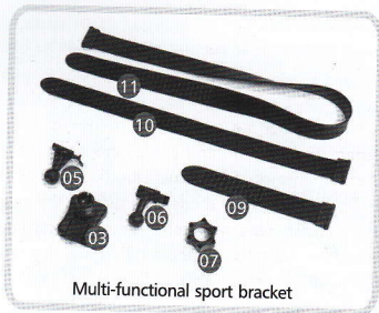
Multi-functional sport bracket