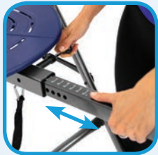
Figure 7 Height settings labeled in inches and centimeters.