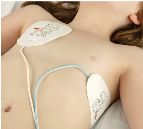
Figure 3: Paediatric AED pad placement (for use on children aged up to 8 years of age, or weighing under 25 kg) 6