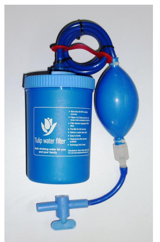
How to make your drinking water safe