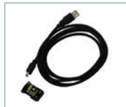
IR connectivity kit