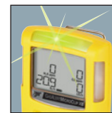
Easy to See