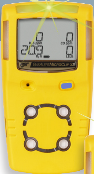
GasAlert MicroClip X3

Guaranteed to run for an entire shift — even in harsh weather.