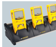
Five unit cradle charger

For a complete list of kits and accessories, please contact BW Technologies by Honeywell.