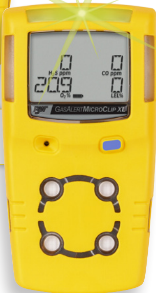
GasAlert MicroClip XL

NEW! GasAlertMicroClip X3 and GasAlertMicroClip XL now feature IP68 for maximum water and dust protection — up to 45 minutes at a depth of 1.2 m.