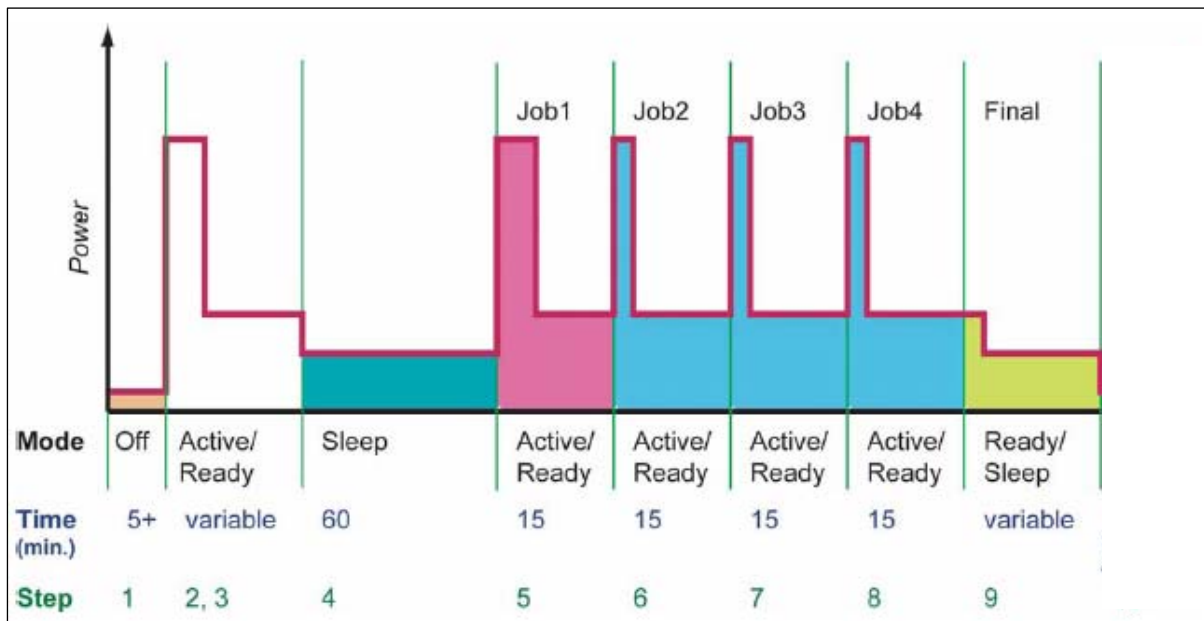
Figure 1 - TEC Measurement Procedure

Figure 1 shows a graphic form of the measurement procedure. Note that products with short default-delay times may include periods of Sleep within the four job measurements, or Auto-off within the Sleep measurement in the Step 4. Also, print-capable products with just one Sleep mode will not have a Sleep mode in final period.