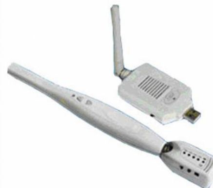
Image Sensor - 1/4 Sony CCD Image Resolution - 2.0 mega pixels Led Lamp ( illumination ) - 6pcs white (5600K) Angle of Vision - 70 degrees