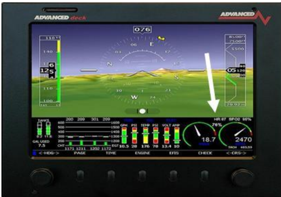
Picture 9 As seen on the Advanced Flight Systems