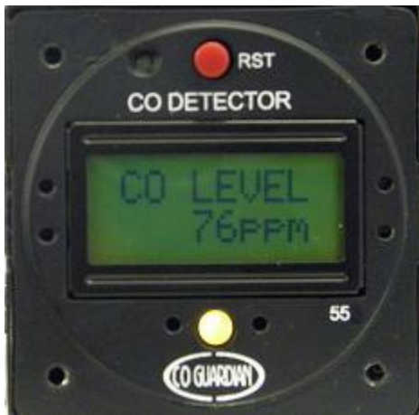
Picture 14 Amber alert light ON

If the AERO-455 is installed to display on the AERO-55 please refer to picture 14 to see how the AERO-55 will show the Amber light when the level concentration of CO in the cabin reaches above 50 PPM for more than 3 minutes. At the moment the amber alarm goes off, you will hear three short beeps every second. Use the "RST" button to shutoff the AUDIO alarm only. The amber light will go away until the CO concentration in the cabin disperses. Please look at paragraph 11 and