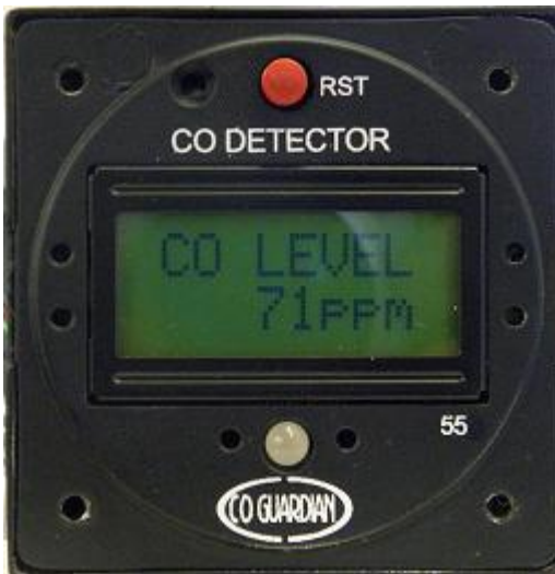
Picture 13 Aero 55 Displaying Carbon Monoxide level in parts per million (PPM).

And for the CO Level display please look at Picture 13.