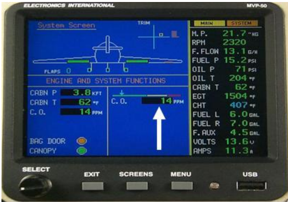
Picture 10 As seen on the MVP-50

When both the AERO-455 (Picture 8) and the AERO-55 display are installed, place a finger in the AERO-455 (as shown on picture 2 above) and hold it for about 10 seconds, readings of the SPO2 (blood lever saturation percentage) and HR (hearth rate) will be displayed on the AERO-55 as shown on Picture 9.