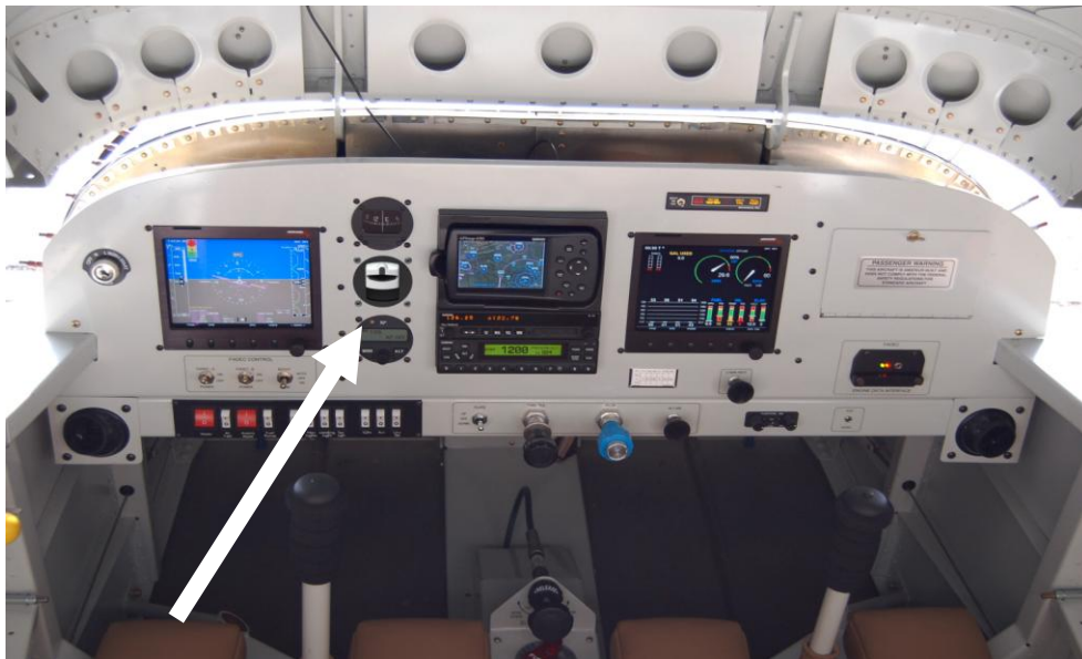
Picture 4 TYPICAL PILOT INSTALLATION SHOWN