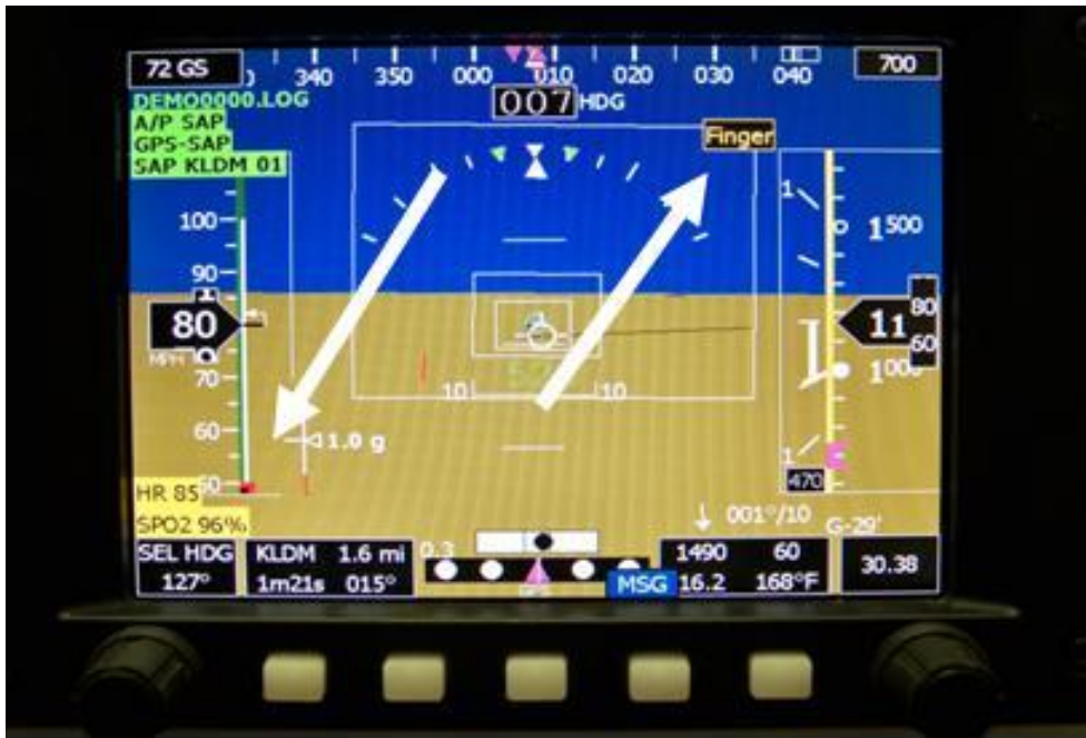
Picture 8 As seen on the Grand Rapids

The AERO-455 is designed to display on the aircraft's MFD. The display page on the MFD depends on the MFD manufacturer. Please see pictures 8, 9 (for the SPO2 and Hearth rate data only), and 10 (for CO Level indication) for an example.