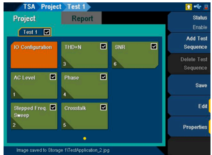
Figure 2. Creating a standard test sequence with default settings

Once completed, the U8903B display should look like Figure 2, indicating that you have set up a test sequence with six measurements. At this stage, all measurements, as well as IO Configuration, use default settings. Next, these settings must be checked and the parameters configured to suit your test requirements.