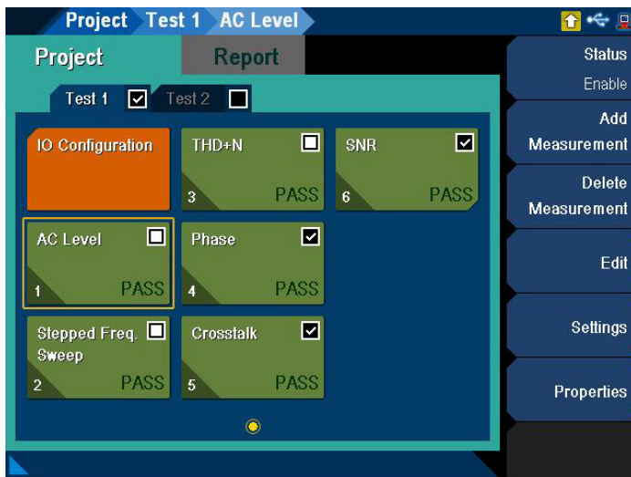
Figure 1. A test sequence example consisting of six audio measurements

This application note demonstrates how to create a test sequence using the Keysight U8903B. The test sequence example consists of six commonly-used audio measurements that are widely used to test consumer and professional audio devices, broadcast devices, and internet audio. The sequence includes measurements for level, frequency response, THD+N, phase, crosstalk, and signal-to-noise ratio (see Figure 1). Throughout this application note, bold text is used to indicate keys on the instrument. Text in [ ] refers to softkeys presented on the instrument's screen.