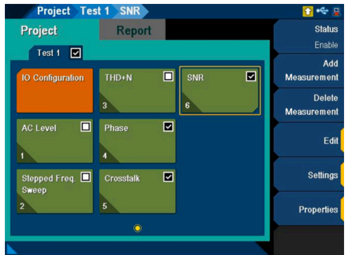
Figure 4. Modify the default setting and test report content to fit your measurement requirement.

Press [Return] to go back to the test sequence on the main screen. Continue modifying each of the settings for the other measurements to suit your test application and indicate what content to included in the test report. The main screen of U8903B should look like Figure 4.