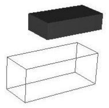
Fig 3: An instance of the boxbox problem

This is a specification for a problem in which a box in three-dimensional space is to be moved inside a container (also a box).<sup>1</sup> The problem is described using analytic geometry (the familiar geometry learned in elementary school). The moving box can only move along the axes of the coordinate system (6 directions) and the movement is performed in steps of length one.