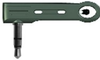
Figure 2: Temperature sensor Instruction