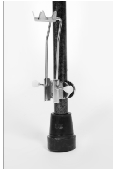
Ice Grip shown in the UP position

The Ice Grip can be locked in the up position when not in use (see prior instructions on how to do this).