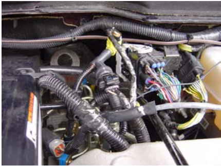
Figure 3.1 Grounding Location for Dodge Cummins is located on the drivers fenderwell near battery. If this is crowded with accessories please find another suitable clean ground.