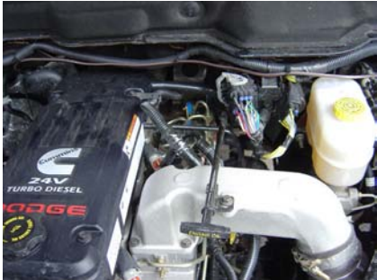
Figure 2.1. Boost Sensor is located just aft of the fuel pressure sensor near injector connectors 5&6.