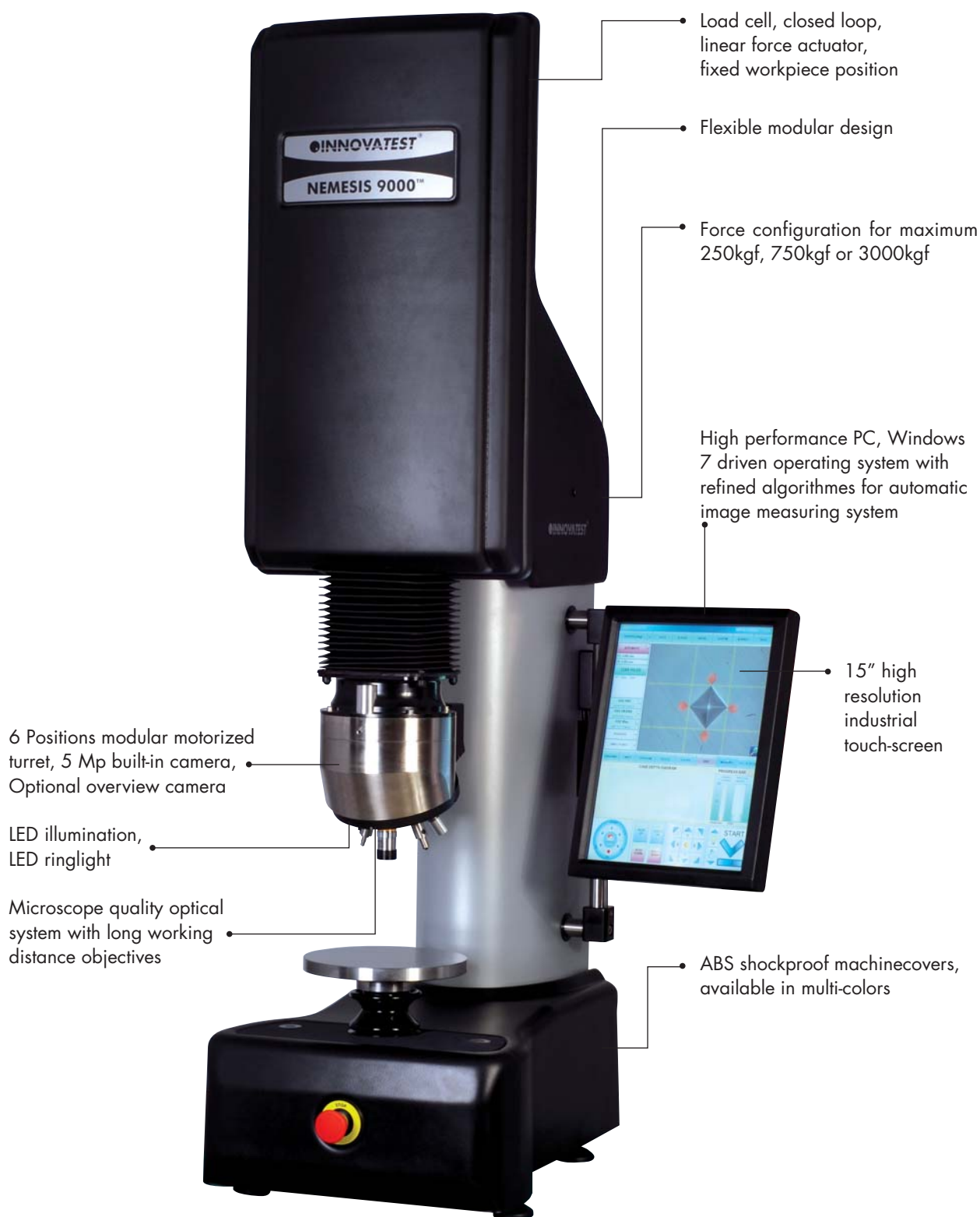
NEMESIS 9000™ SERIES 0.5KGF TO 3000KGF, 6 POSITION MOTORIZED TURRET