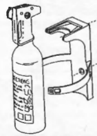
Using The Mounting Bracket (Included)

NOTE: Since wall surface types vary, mounting screws are not included. Purchase screws or bolts specifically designed for the surface on which you will mount the fire extinguisher. The fire extinguisher label lists its maximum weight.