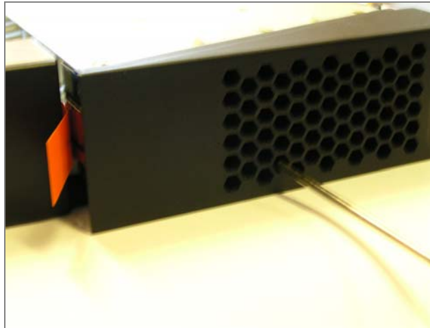
Figure 4.22 Magazine release tool in use

Figure 4.22 shows the release tool inserted into the correct hole on the right hand side magazine bezel.