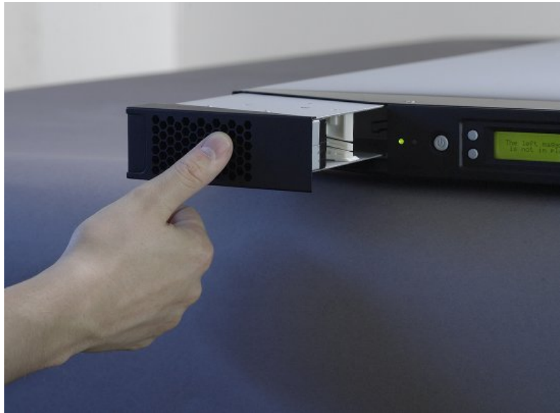
Figure 4.20 Push magazine until it clicks into place