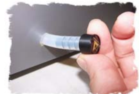
Picture 7 Tube stopper on the backpanel

If you cleaning the fluid storage tank, never switch the motor on ! Please stop the current entry!