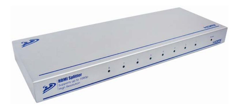
SP-H00108 8-Port HDMI Splitter