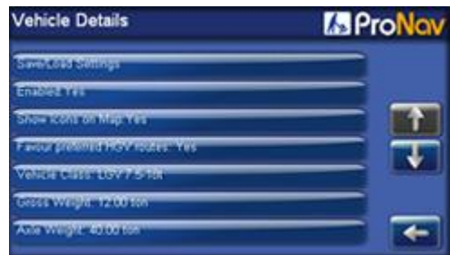
Easily enter your vehicles vital statistics