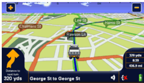
Clear 3D mapping