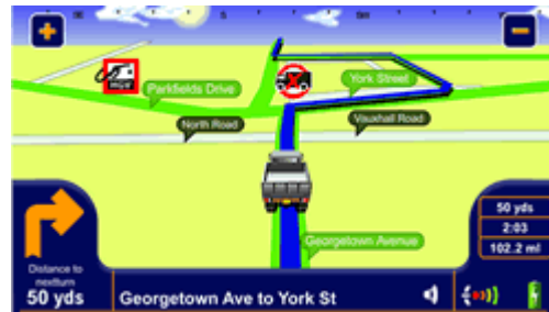
Avoid restrictions automatically