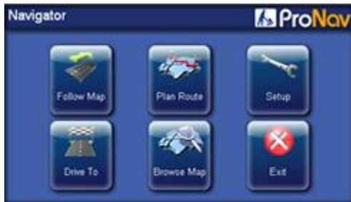
Easy to use interface