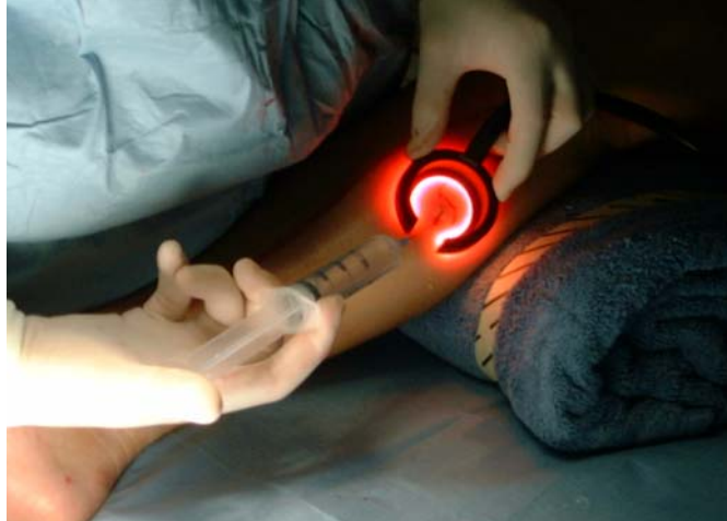
Figure 2. Large ring light has wide opening for use during vein treatments

The standard Veinlite model comes with a large ring light attachment, or ring illuminator, which is specially designed for mapping larger veins and finding reticular veins. The large ring illuminator has a wide opening to facilitate use with lasers during sclerotherapy treatment.