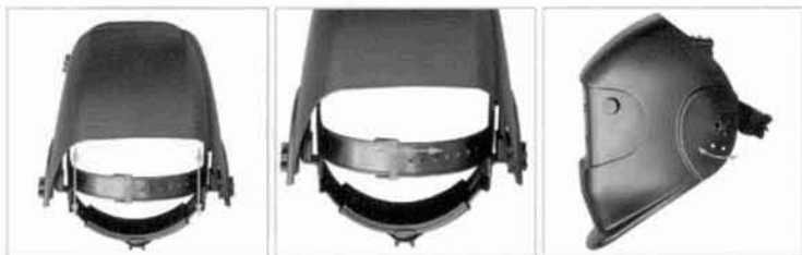
SHADE GUIDE TABLE (NO.1)

As a result of above mechanism action, The welder surely feels more comfortable than before, and are in working with more high proficiency at any time.