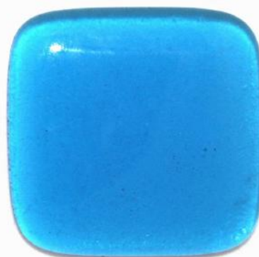
3 layers, total 9 mm Size has grown and shape has "blown up"