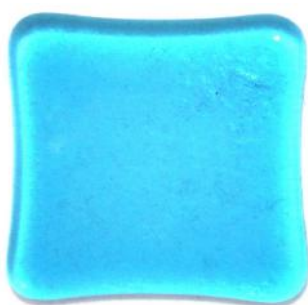
1 layer, total 3 mm The glass was pulled inwards

Like any other liquid, glass has its own surface tension, which for glass is approximately 5 millimetres. This implies that glass, when heated up to 800 °C / 1500 °F will pull or flow to a thickness of approximately 5 millimetres. This is important to keep in mind when making new glass pieces! Most fusing glass is manufactured in a standard thickness of 3 mm. When you want to fully fuse 2 pieces together, it is therefore advisable to lay 2 pieces on top of each other that are exactly the same size. Then you can expect a result of similar size and shape after firing (the edges will be somewhat round and nicely fused to one piece). It also means that with 3 layers of each 3 mm glass (total 9 mm), your glass will flow and flatten to a thickness of maximum 5 mm. The size will have increased and the shape will have become more round. Fusing a piece of 3 mm to high temperatures will result in a smaller piece, which has changed in shape and grown in thickness. A very small piece can even be fused to a little ball in this way!