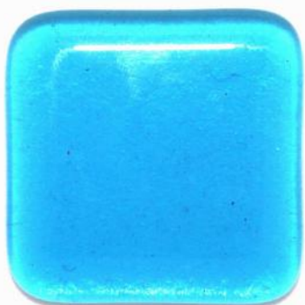
2 layers, total 6 mm No loss of shape, nicely rounded edges