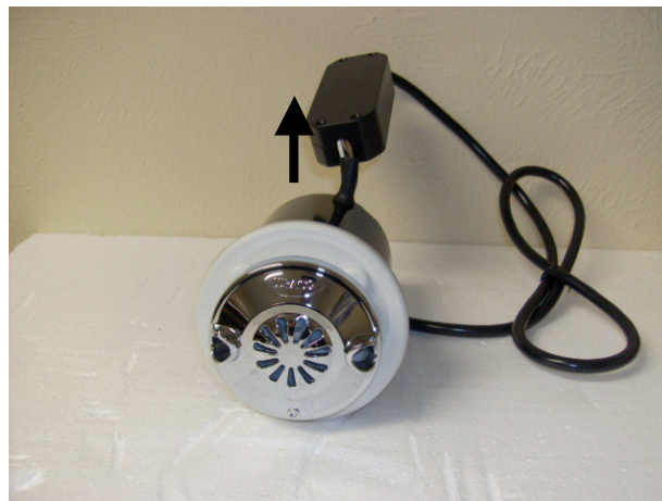
Figure 3. Power cord must be in up position as shown