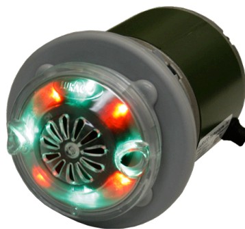
Magna-JET with LED