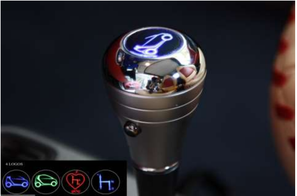
Photo 1: The Gear Shift Knob in chrome finish by Smart Power Design.

All work should be performed with the utmost care to avoid any damage.