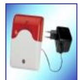
Wireless Siren with Strobe