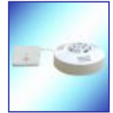
Wireless Heat Sensor