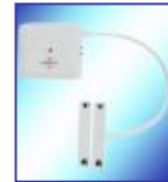
Wireless Door Sensor