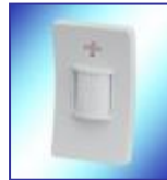
Wireless Motion Sensor