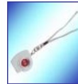
Remote Controller (Necklace)