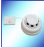
Wireless Smoke Sensor