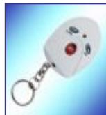
Remote Controller (Keychain)