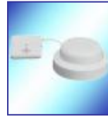
Wireless Fire Sensor