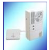
Wireless Gas Sensor