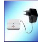
Wireless Electric Power Sensor