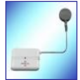
Wireless Window Break Sensor