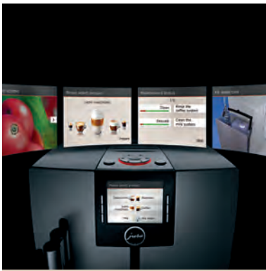
TFT display with Rotary Selection