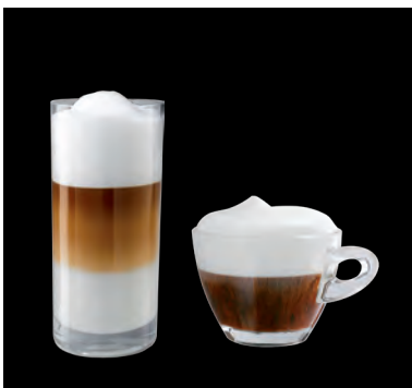
Revolutionary fine foam technology