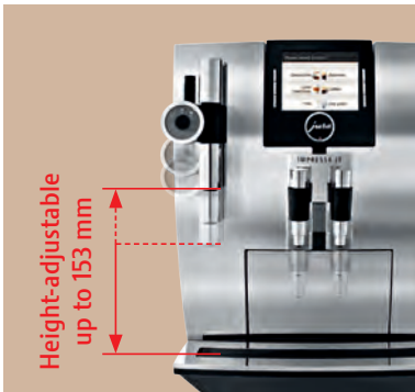
Height-adjustable cappuccino spout on a continuous scale up to 153 mm