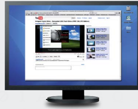
See the Integral Crypto Encrypted USB Drives in action at

New to the range this year are the Integral Crypto DUAL and DUAL+ offering an optional master password override in addition to a high-strength user password. If a user forgets their password the Crypto DUAL and DUAL+ drives can be accessed with a master password by an IT administrator. Crypto DUAL is also compatible with both Windows® and Mac® operating systems. Crypto DUAL+ includes the same features as the Crypto DUAL but in an expanded design, to allow for greater storage capacity, starting at 64GB and 128GB.