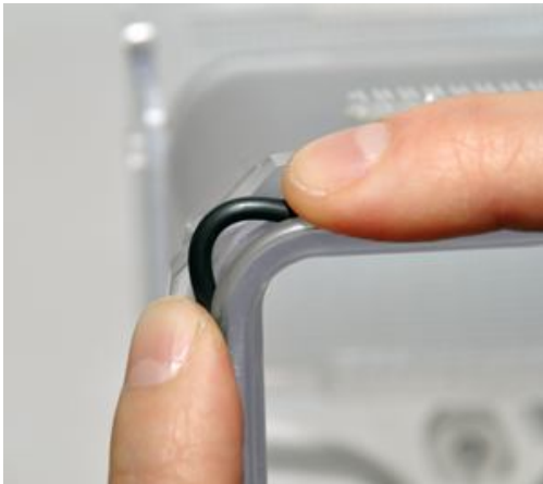
(Fig.4) Stretch the O-ring

Replace the O-ring into the groove; run a finger round the O-ring, to make sure it is snugly seated in the groove.