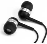
In ear earphones