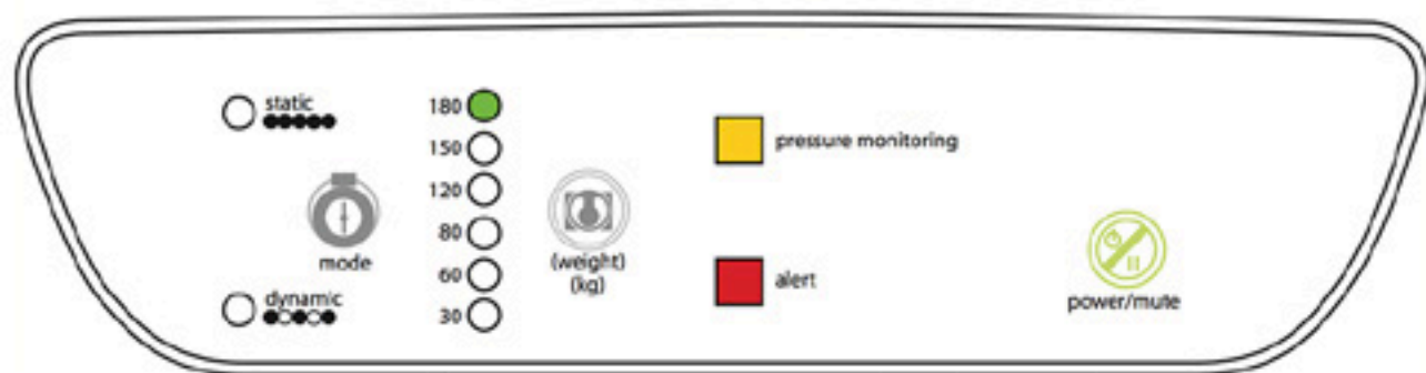
Control Panel Features (Figure 5a)