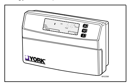
FIGURE 1:PROGRAMMABLE ELECTRONIC THERMOSTAT

A complete operating instruction is provided by the manufacturer for each thermostat. Familiarize yourself with its proper operation to obtain the maximum comfort with a minimum of energy consumption.